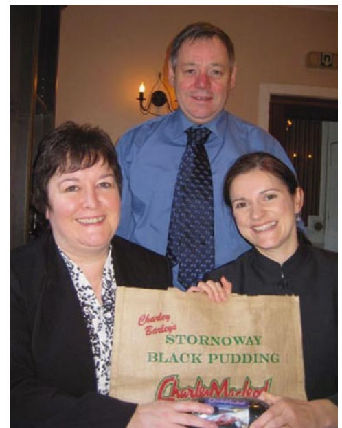
Catherine with Rhoda Grant MSP, supporting the 'Black Pudding Campaign', designed to gain European Protected Status for Stornoway Black Pudding.

travel. Indeed, even if cost is not a consideration, older people may find that they are prevented from purchasing insurance from some companies on the grounds of their age, especially if the company imposes a maximum age limit. These factors can make it difficult for healthy, active older people to travel abroad whether to visit relatives or solely for pleasure. Draft legislation at the European level could put a stop to unfair age-based pricing in the insurance sector and this is something I am going to pursue over the course of the next term. I am going to push for insurance companies to base their quotes on actual risk, as opposed to assumed risk, which will result in a fairer deal for elderly people. Numerous constituents have contacted me with their concerns and asked me to act on their behalf. I will work hard to make sure no one is left behind because they have been discriminated against because of their age.